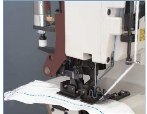
Tractor-type presser foot on style BM111C2